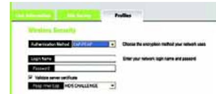
Figure 6-28: EAP-PEAP Authentication

Click Next to continue or Back to return to the previous screen.